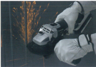
Reinforcing bar cutting